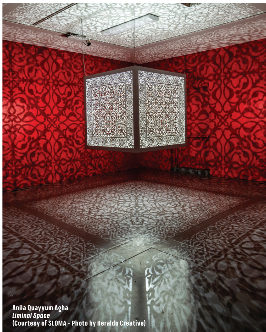
Anila Quayyum Agha Liminal Space

tage, and fusing these motifs with modern Western narratives in a reflection of the immigrant experience of resilience and shifting milieus, Agha's work creates a shared space of light, shadow and pattern in which all are invited to safely gather. Her mixed-media compositions using reflective materials and intricate embroidery and beading further merge approaches and references to create unique and transcendent objects that are both beautiful and saturated with meaning. Through Oct. 29.