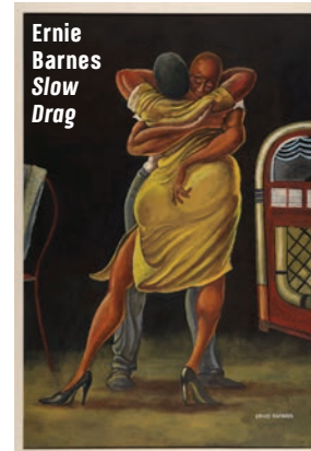
Ernie Barnes Slow Drag