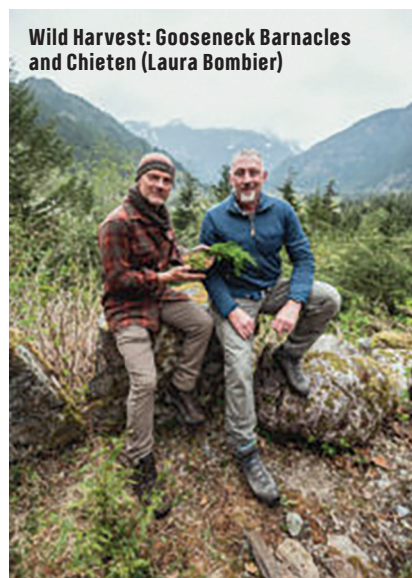
Wild Harvest: Gooseneck Barnacles and Chieten

We All Scream digs deep into the deaths of four who died from a listeria outbreak