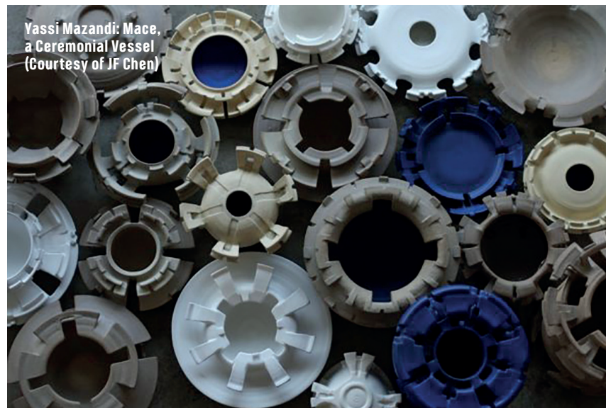
Yassi Mazandi: Mace, a Ceremonial Vessel