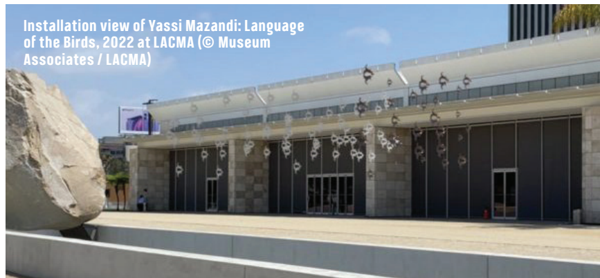
Installation view of Yassi Mazandi: Language of the Birds, 2022 at LACMA