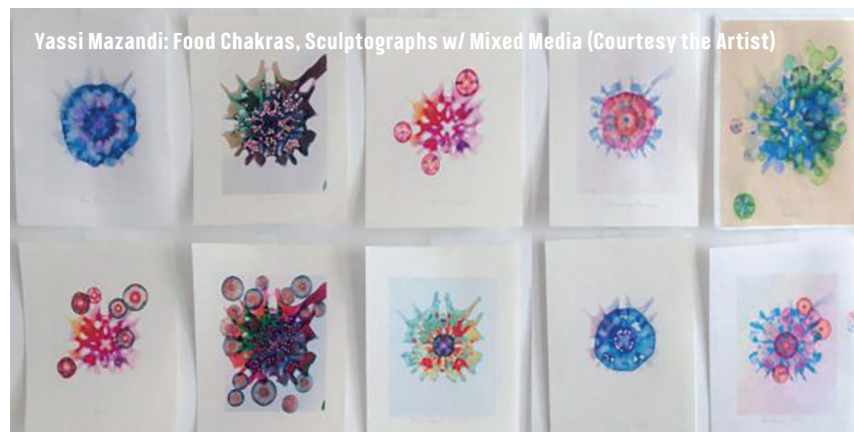
Yassi Mazandi: Food Chakras, Sculptographs w/ Mixed Media (Courtesy the Artist)