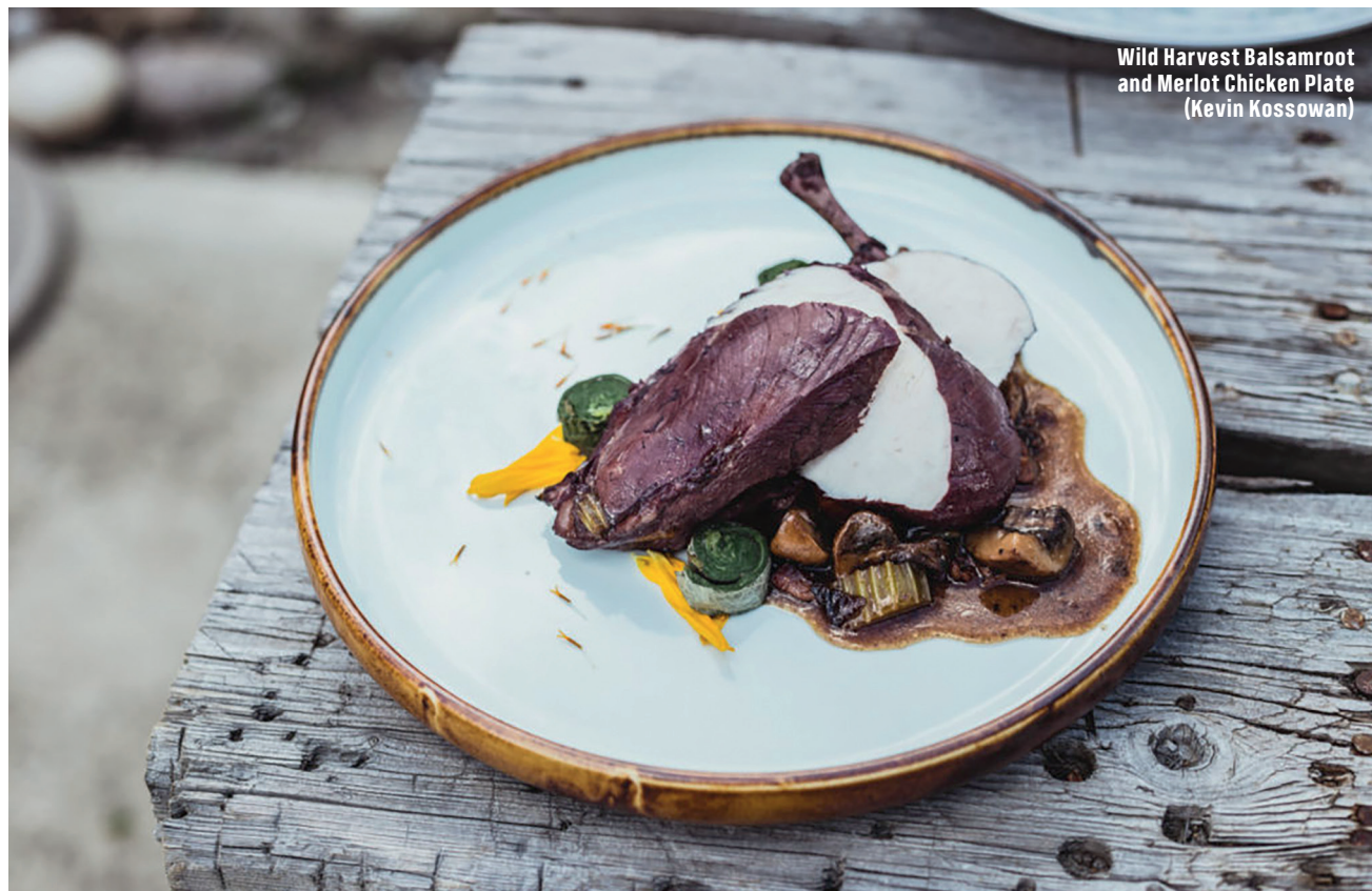
Wild Harvest Balsamroot and Merlot Chicken Plate (Kevin Kossowan)