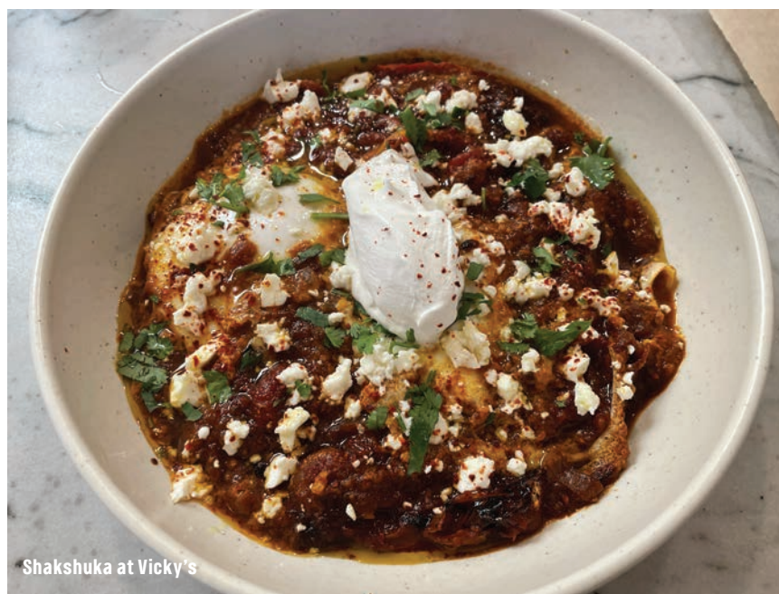
Shakshuka at Vicky's