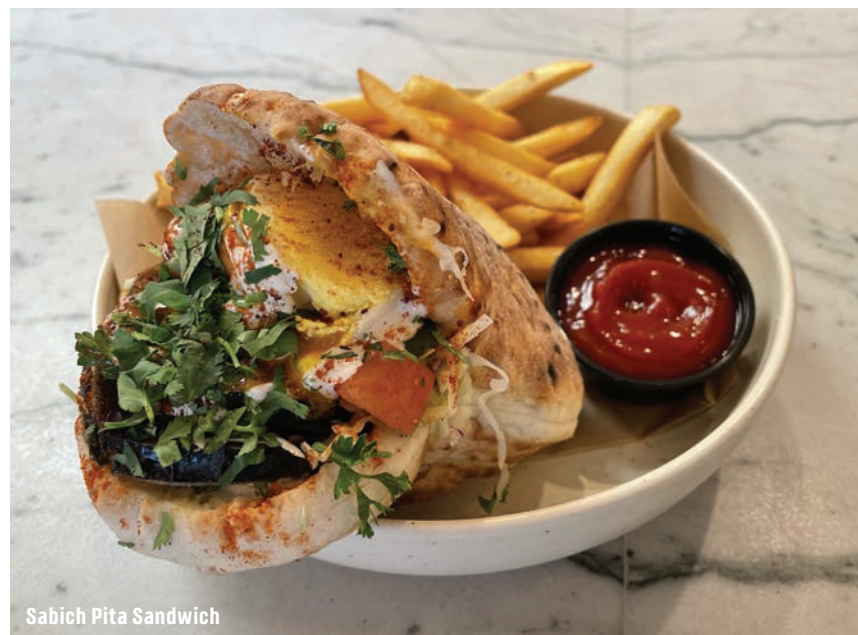
Sabich Pita Sandwich

Leaning heavily on the diversity that is both the Mediterranean and Japanese diets, another signature dish that keeps returning customers coming back is the sabich pita sandwich, made with brined eggplant. The eggplant soaks up the moisture, which prevents the oil from entering the vegetable, so instead of soaking up the oil, it soaks up water. He adds a spice mixture of cumin and