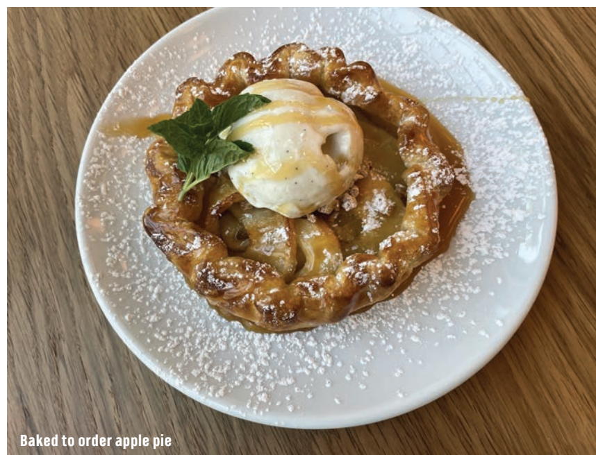
Baked to order apple pie

curry and a tahini sauce, which is a mix of ground peppers, mint, cilantro and garlic. It's stuffed into a soft pita with Israeli chopped salad, cabbage slaw and fermented mango sauce. There are also a few heavier options like a fried chicken sando with honey sriracha sauce and pickled slaw on a brioche bun and a double patty bistro burger with pastrami marmalade, gruyere cheese, greens and pickled shallots.